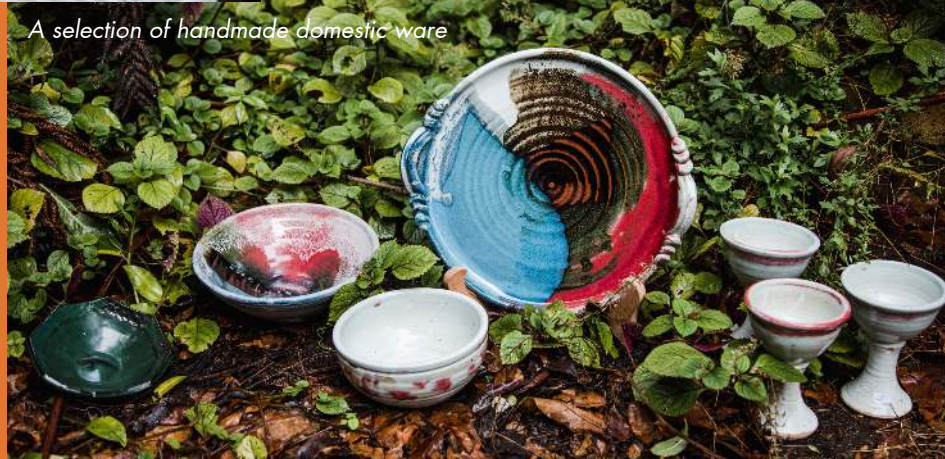
A selection of handmade domestic ware

Booking available from May 2024 onwards.